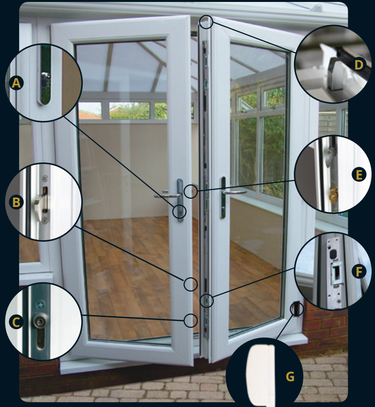
PAS 24 Enhanced Security as standard